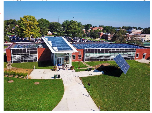
In its first few months of operation, the Lombardo Welcome Center at Millersville University has generated nearly three times more energy than it has consumed.

reducing campus energy demand and greenhouse gas emissions while saving some $25,000 annually in electricity costs. Faculty from various departments brings their students through the building to explore green building design and discuss topics such as energy policy, sustainability, and innovation. In 2019, the university plans to conduct STEM workshops focused on advanced energy technologies for education majors, as well as for students from local elementary and middle schools.