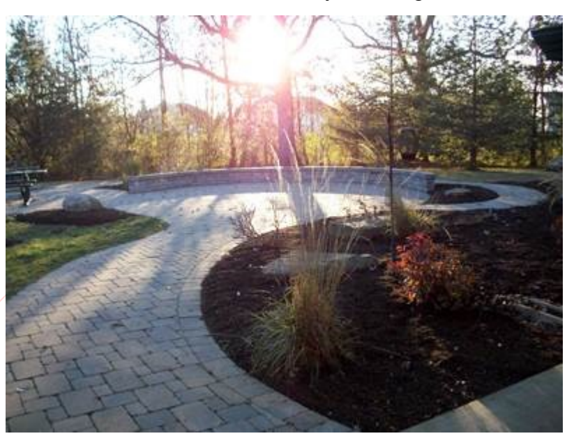
Through a partnership with the Lake County Forest Preserve, Meadowview Elementary School fourth graders learn about invasive plant species and cut down buckthorn in the campus woodland each fall

students focus on being active with their families. Challenges to date have included a family onemile walk, a play in the snow, and a tracking of the fruit and vegetables eaten over the weekend. Students return each week with their challenges completed and with pictures of their families exercising together. Partnerships with local businesses facilitate free physicals, vaccines, vision checks. and dental exams.