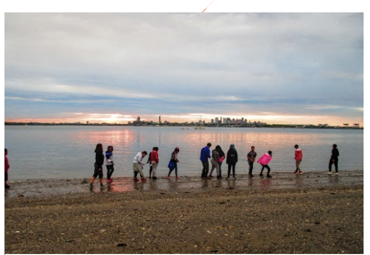
2The Boston Green Academy outdoor club gives students the opportunity to experience the natural world through participation in camping, hiking, canoeing, cross country skiing, and snowshoeing.

The school adheres to district policies for green cleaning, integrated pest management, environmental audits, and no-idling, among other areas of school environmental health. BGA's chemistry teacher is trained and supported by Beyond Benign, a nonprofit that provides educators with the skills and tools to teach green chemistry in their classrooms and laboratories. The Office of Counseling and Wellness consists of social workers, guidance counselors, counseling interns, and a school nurse. To support school culture, BGA incorporates restorative justice approaches and other social-emotional learning models.