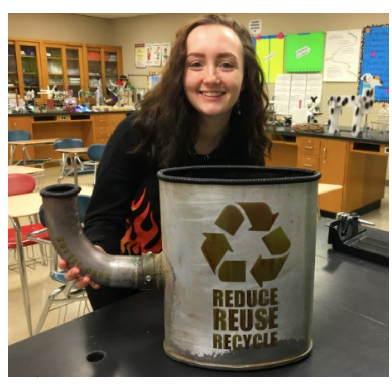
Working with her father, a Herculaneum High School student repurposed a muffler into a watering can.

Herculaneum has a high poverty rate. In ninth through 12th grade home economics classes. students learn how to purchase healthy foods on a budget and create healthy weekly menus. They also learn how to remake leftovers. The school recently received a grant to have a dentist and psychologist in the district, whom students and their families can visit any time during school hours. Families are encouraged both to donate and take any clothing items from the school's sharing closet. Herculaneum has an exchange program for household goods, where