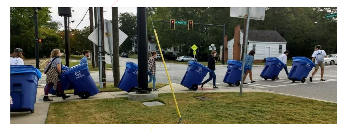
Georgia College and State University students bring recycling into the community during the Deep Roots Festival.

The Office of Sustainability (OOS) is responsible for campus sustainability initiatives; promoting education and outreach; and offering opportunities for internships, volunteering, service learning, and community service. The OOS has provided some 30 internships with over 10,000 hours of service, including opportunities for experiential learning, leadership, and professional development, all while having a positive and tangible influence within the campus community. Partners include the Sustainability Council, the Sustainability Fee Program, the Campus Kitchen at Georgia College (CKGCSU), the gardening club, and the environmental science club.