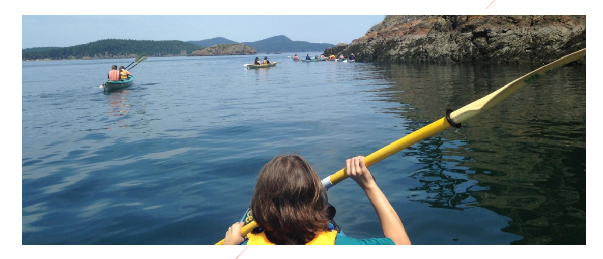
Northwest School students participate in a late spring outdoor program overnight kayaking trip in Puget Sound.

There is no car parking for students and few spaces for faculty. All are encouraged to use the lowest carbon transportation possible. The school provides a secure bicycle shed with a capacity of several dozen, as well as highly subsidized public transit passes for faculty. The school encourages carpooling among students and faculty by making a carpooling app available. Students in the environmental student group organize an annual bike and walk to school day to raise awareness for lower carbon transportation. Students collect data on how their peers commute throughout the week.