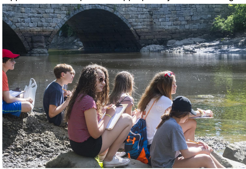
Seventh grade students at Ipswich Middle-High School spend two weeks on field trips learning about the history of the coastal town and how the environment has impacted it, including two days canoeing, conducting water quality tests, and learning conservation values.

In 2017, the middle school green team raised more than $20,000 to build a school garden in front of the building. The garden consists of raised beds for vegetables and flowers, as well as fruit trees and an outdoor classroom.