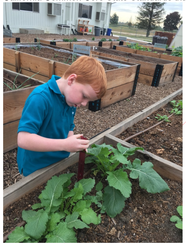
A Quail Lake first grader collects data in the garden, using a ruler to measure plant growth.

School grounds include 4,000 square feet of garden space featuring an outdoor classroom environment, a 2,000-square-foot butterfly garden, and planter beds in the front of the school that provide students with opportunities to study fruit production and plant management. The garden includes a 17 x 35-foot greenhouse to which all students have access and can use in various ways. Students in kindergarten through fifth grade visit the garden every two weeks for garden lessons led by their teacher and the school's science instructional support provider. Lessons not only focus on gardening skills, but also tie into the California NGSS and California Common Core State Standards that are being taught in the classroom.