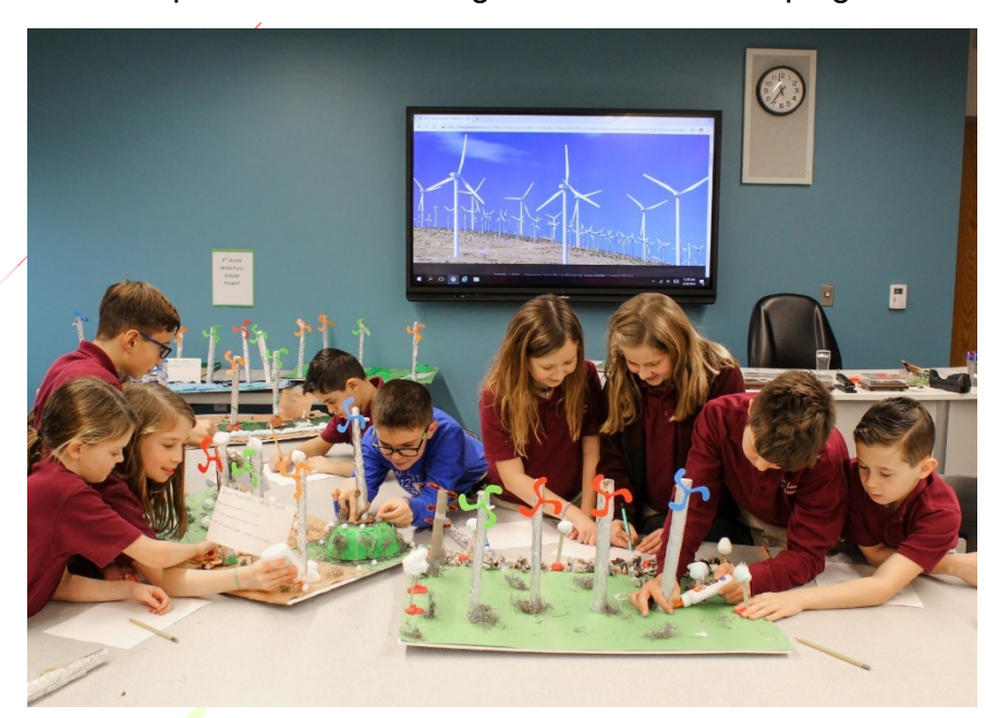
Saint Leo the Great students design and build wind turbines.

In 2014, the school's nature courtyard, located in the center of the school building, was designated by the National Wildlife Federation as a