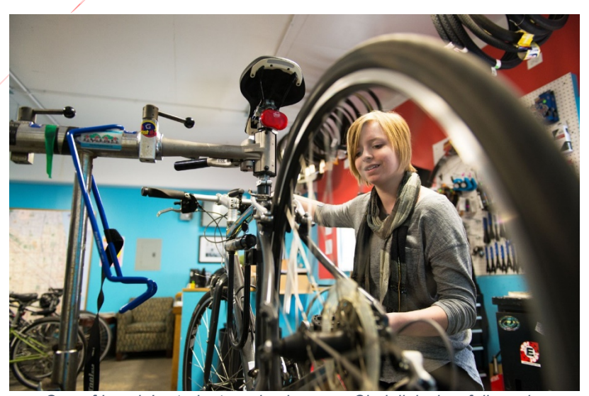
One of Loyola's student-run businesses, Chainlinks is a full-service bike shop and rental program. Loyola also encourages alternative transportation with electric vehicle charging, protected bike corrals, transit passes, and discounted bike share participation.

Due to the urban nature of Loyola campuses, over 95 percent of students and 70 percent of employees take a sustainable transportation option while commuting, such as public transit, biking, or walking. Loyola supports these efforts with discounted bike share and transit benefits. The Lake Shore campus of Loyola is on the shores of Lake Michigan; it is a model for coastal development