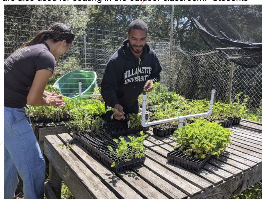
Local high school students and staff from local nonprofit One Cool Earth provide Carrisa Plains with starters for their garden.

Instructional time recently was set aside for students to create and design habitats for native animals to use as hideouts. Once the design phase is complete,