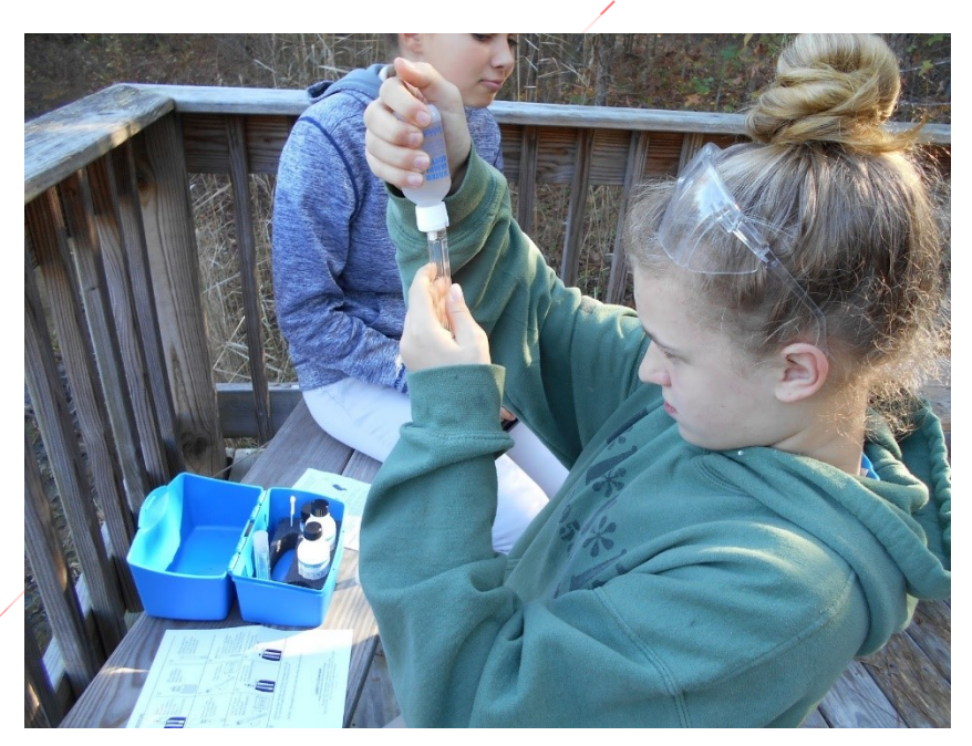
As part of their environmental education, students The Jefferson School test local water quality.

Since 2010, Jefferson has cultivated alliances with regional partners to build a naturecentered, active curriculum. Partners include the Delaware Nature Society, the University of Delaware College of Marine Studies, the Lewes Historical Society, Delaware Tech. Delaware Department of Natural Resources and Environmental Control solar car and bridge challenges, the Delaware Bee Keepers Association, Delaware Wetlands. Nanticoke