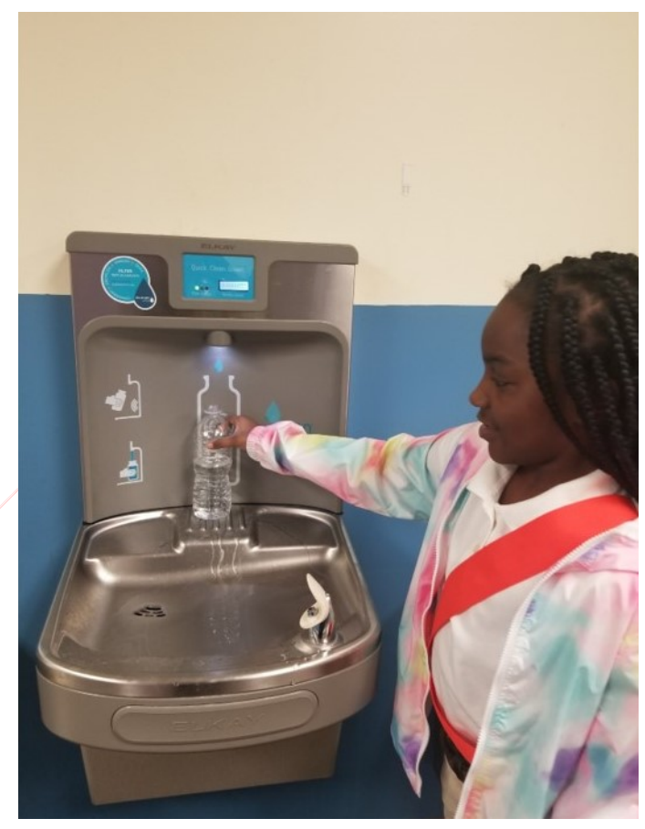
Students at Gadsden have water bottle filling stations available to them to encourage healthy hydration and reduced single-use plastic bottle use.

Students engage in five-minute brain breaks throughout the day to move their bodies and subsequently increase focus. Safer, Smarter Kids is an annual training session for students in kindergarten through fifth grade, teaching students how to better protect themselves from physical and mental abuse. A Character Counts program has been implemented, with six pillars of character development to help students exemplify appropriate