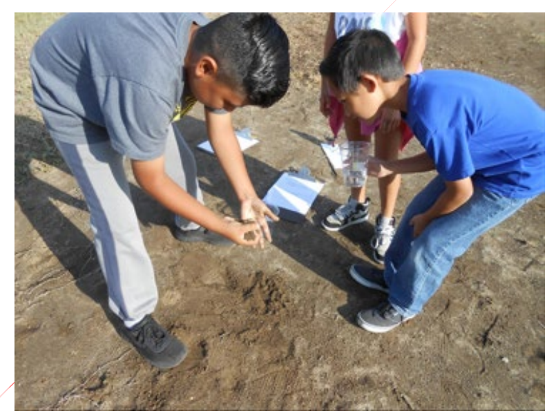
Rialto Unified School District fifth-graders plan their garden and test soil quality.

The landscaping at most elementary, middle, and high schools, as well as at the district office and the district professional development center, has been replaced with drought-tolerant plants