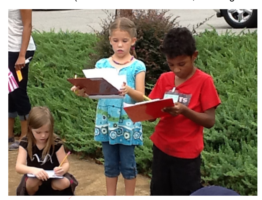
Dutch Fork Elementary School's curriculum aligns with state standards by grade level, following a themed continuum titled "from the mountains to the sea" that explores the South Carolina landscape within a global context.

The school initiated a food waste and compost program to divert waste from landfills. In the process, students collected data to show how much waste has been diverted in a given month. Current projections put food waste diversion at 5,000 pounds per month and a decrease in hauling fees of