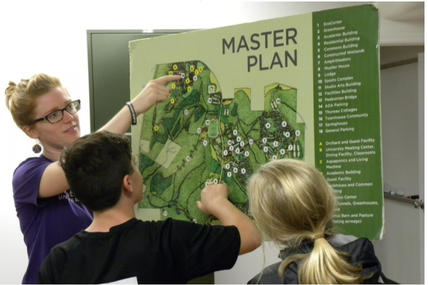
Eden Hall Upper Elementary School students analyze their school facility and grounds master plan with a view toward their next sustainability project.

Water is tested periodically for lead exposure, and all toilets are low flow. Aerators and faucet screens are cleaned regularly. Routine testing is conducted to observe radon levels as well as water and air quality. In addition, all light bulbs, batteries, glass, chemicals, and electronics are recycled or neutralized for disposal. Old computers, monitors, and TVs are recycled as well, along with printer cartridges and cell phones. Green cleaning is the standard, with very few products used for nightly