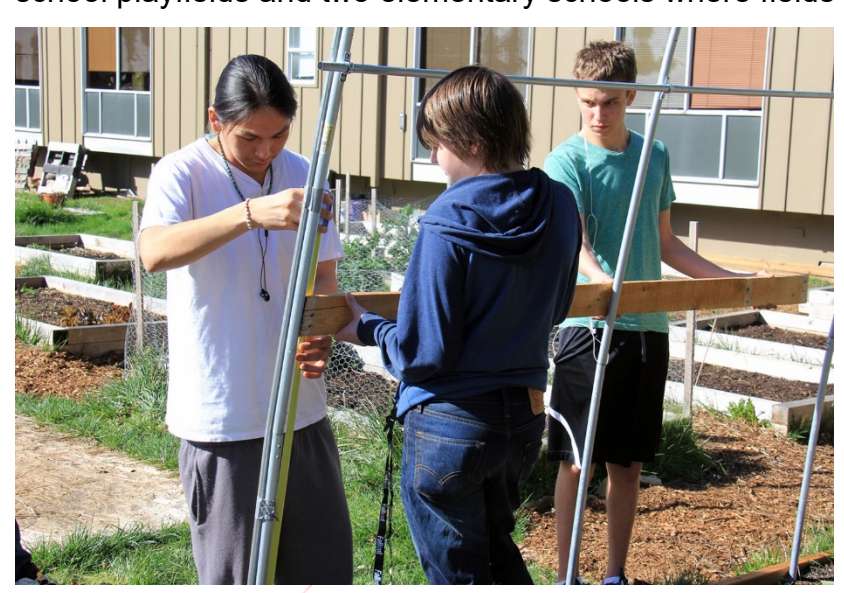
Students at Emerson High School in Lake Washington School District work to finish a hoop house as part of the Green Sustainable Design Technology class.

Since the 2005–06 school year, LWSD has reduced electricity usage per square foot by 30 percent. Natural gas usage has decreased 37 percent. Benchmarks were reset in 2014. Since then, LWSD has reduced energy usage by 11 percent. LWSD's resource conservation management program has focused on water conservation initiatives since 2008. Since then, LWSD has decreased domestic water usage 30 percent per student, and irrigation water usage by 80 percent. Native plants are used in all landscaping. Irrigation is provided only for secondary school playfields and two elementary schools where fields are used by community