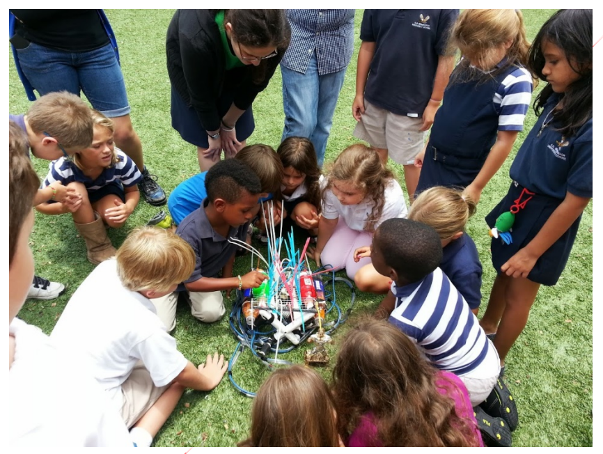
Florida Atlantic University Lab School District kindergarten and first grade students assemble an underwater robot using recycled products.

Hydroponic gardens as well as a butterfly reading garden have been added to various school grounds to encourage use of the lush outdoor areas and beautiful Florida weather. Additionally, the district expanded two outside classroom gardens, including variable systems such as aquaponics, vertical hydroponics, horizontal hydroponics, raised bed gardens, barrel gardens, and a new research-based aquaponics lateral system. These gardens were built in the center of the high school for all students to observe, learn, and participate in care and maintenance. Cistern and rain barrel systems reuse greywater to irrigate plants.