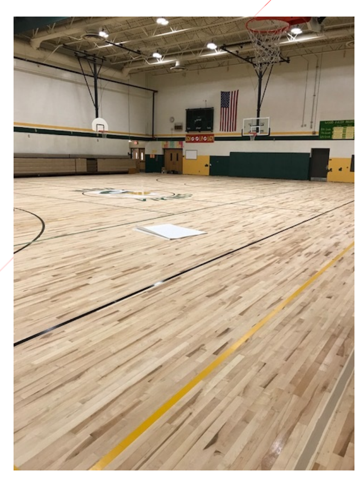
The wood for these Davenport Community School District gym floors came from a processing mill in Merrill, Wisconsin; and these maple trees came from Wisconsin and Michigan. Sourcing wood regionally cuts transportation distance, and, therefore, emissions.

Davenport Schools has implemented a school-based mental-health model. Through face-to-face contact, as well as phone calls and email, Davenport's learning supports specialist for prekindergarten through 12<sup>th</sup> grade, as well as a the Project AWARE mental health manager, coordinate with several community organizations to make