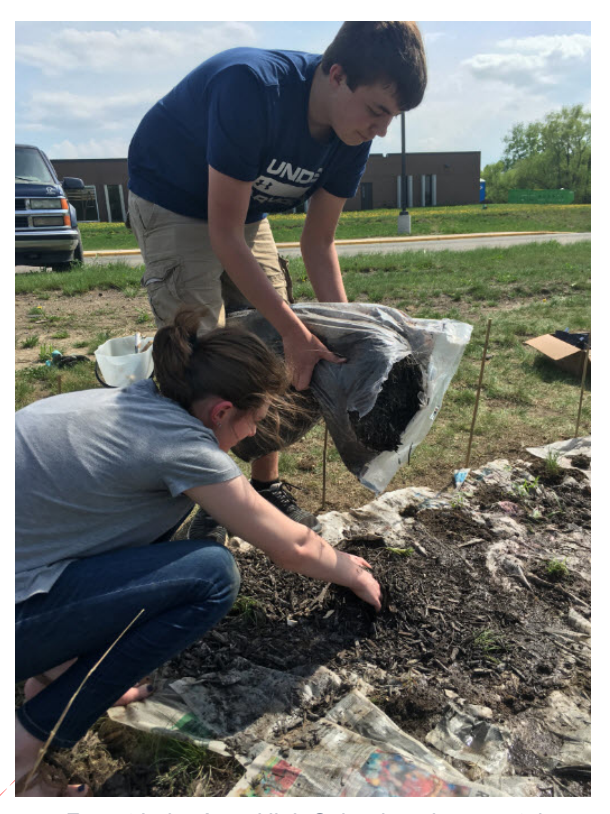
Forest Lake Area High School environmental club members plant native plants in the pollinator garden.

Approximately 1,500 solar panels (418 kilowatts of power) on the high-school rooftop provide 5 percent of the school's energy usage and save the school district some $70,000 per year. Energy-efficient boilers and an updated HVAC system use remote monitoring and zonal setbacks to reduce energy use. The motion sensors in each room identify occupied versus unoccupied spaces and automatically adjust room temperature. Occupied zones are set between 70-72 degrees Fahrenheit and unoccupied zones are set at 65 degrees Fahrenheit in the winter and 85 degrees Fahrenheit in the summer. The cumulative environmental impact of these energy-efficient renovations is a 39 percent reduction in greenhouse gas emissions on a squarefootage basis over five school years. FLAHS uses the B3 Benchmarking program to track energy and water