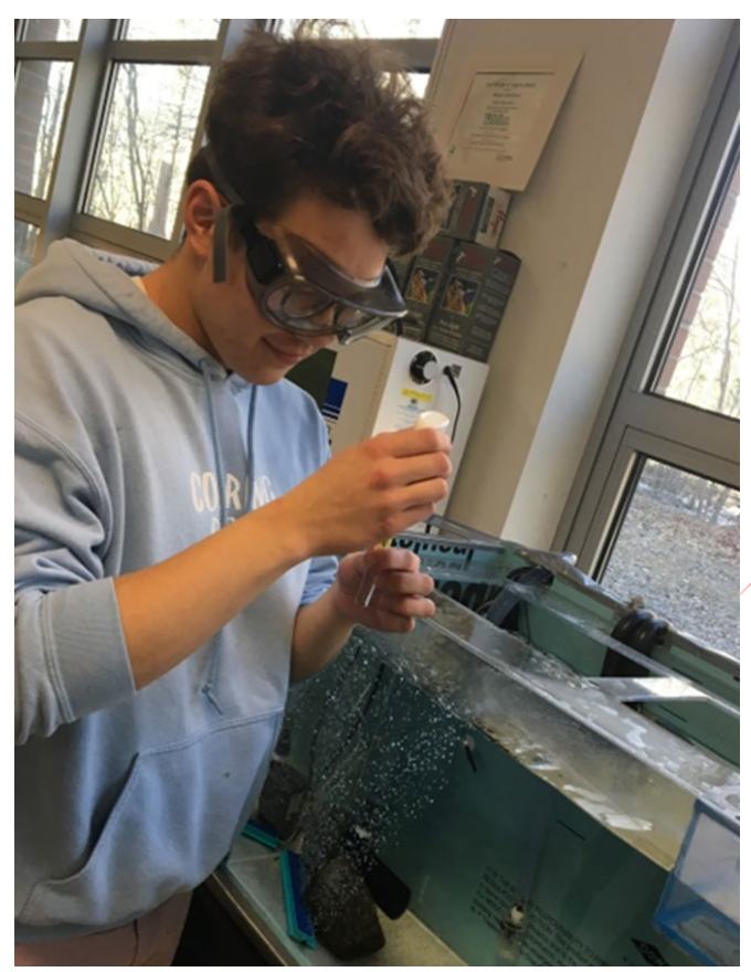
A Weston High School AP Environmental Science student experiments with a trout habitat as part of Trout in the Classroom participation.

In addition to its commitment to educating students about sustainability, Weston High also is committed to teaching them about the environment. This is evident in the high priority placed on the health and well-being of students, as well as in the creation, structure, and operations of Weston High. When the school added a new science wing in the past decade, officials built to LEED Silver certification standards.