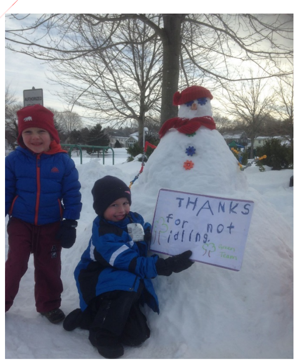
Students and parents have worked on no idling campaigns at pick-up lines across Wellesley Public Schools.

The WPS Bates School was the first in New England to participate in the EPA's Food Recovery Challenge. After assessment, goal setting, and project implementation, the resulting recycling and food waste diversion project resulted in a 40 percent reduction of the school's cafeteria waste. Now, the program has been expanded to two more elementary schools, which are implementing share tables, aiming to eliminate food waste, and providing food to those in need. In addition, all WPS cafeterias across the district now collaborate with area colleges as part of a Food Recovery Network to donate unused, cooked food to Food For Free, a Cambridge-based nonprofit. Food For Free distributes single-serve meals to people who are food insecure, including students at MassBay