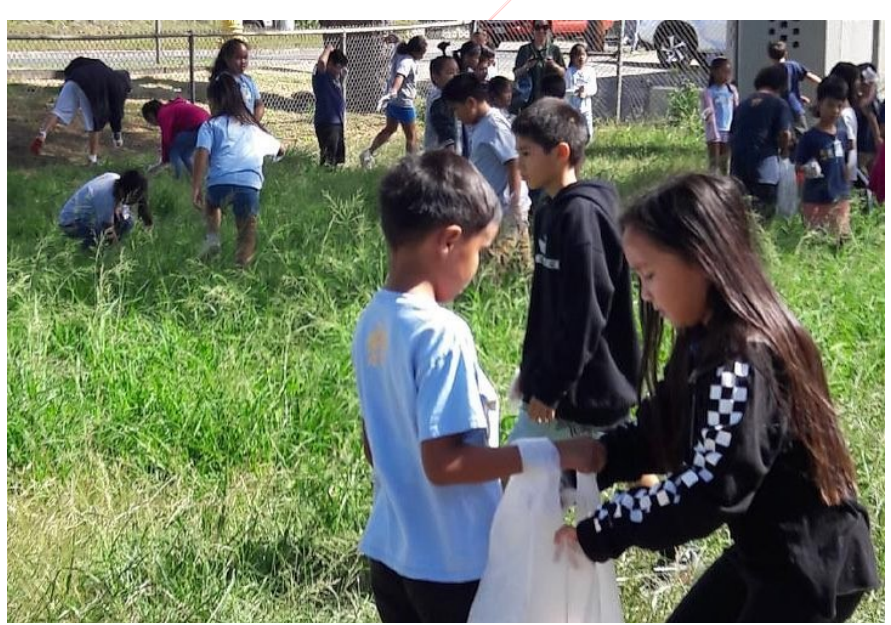
Kapālama Elementary School students participate in an annual campus beautification day.

Kapālama has reduced its footprint and expenses with a statewide, multidimensional energy program called Ka Hei, which includes energy-efficiency measures, renewable energy additions, and behavioral change. KES has reduced nontransportation energy use over two years by 68 percent and greenhouse gas emissions by 45 percent.