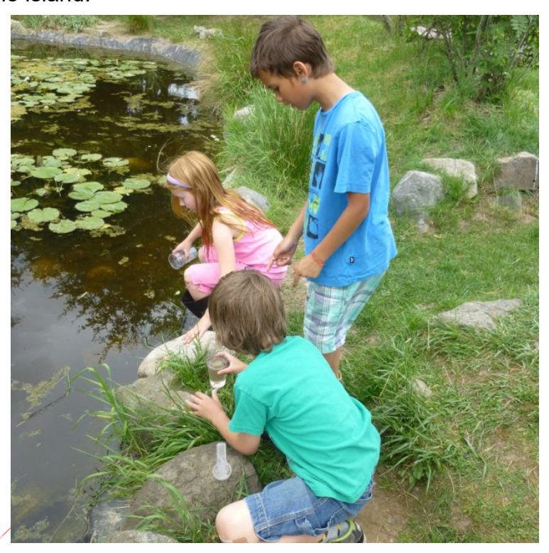
Elementary students in the Lopez Island School District conduct water sampling and search for aquatic insects at Rishi Pond, one of the many outdoor classroom sites on campus.

The district has established IAQ management plan and an asthma management plan