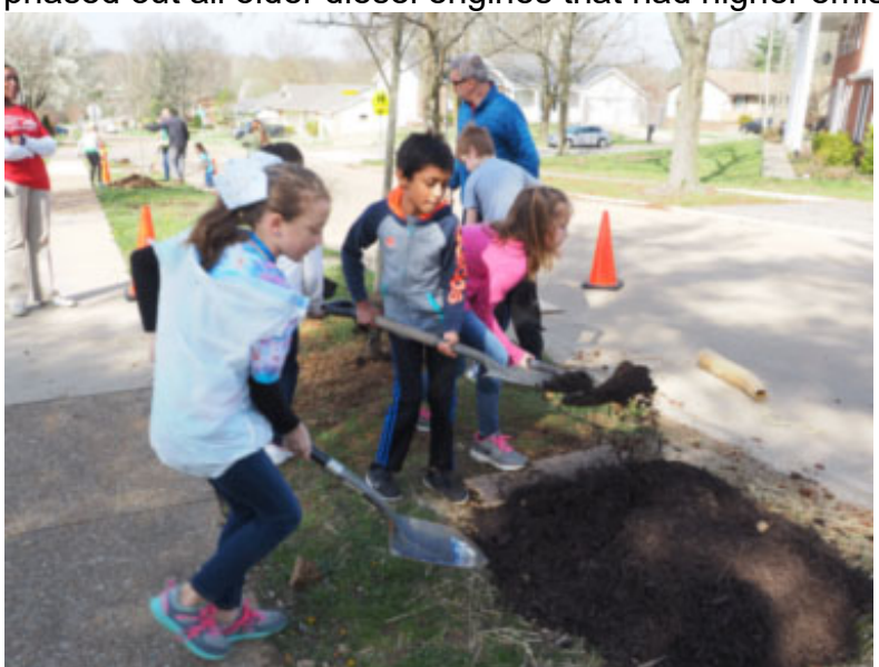
Highcroft Ridge Elementary School students work with community members to complete a tree planting project.

Every year, physical education teachers coordinate a Walk to School Day. More than 85 percent of students use buses to get to school. The district has completely phased out all older diesel engines that had higher emissions (model year 2007 and