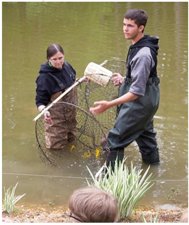
Douglas Byrd High School Academy of Green Technology students offer environmental education outreach to the public.

Supported by a recent grant, AoGT and the school's culinary-arts students have developed the Communities in Bloom initiative to teach gardening and help the local community grow its own fresh food. Students involved in the initiative provide containers, seeds, and