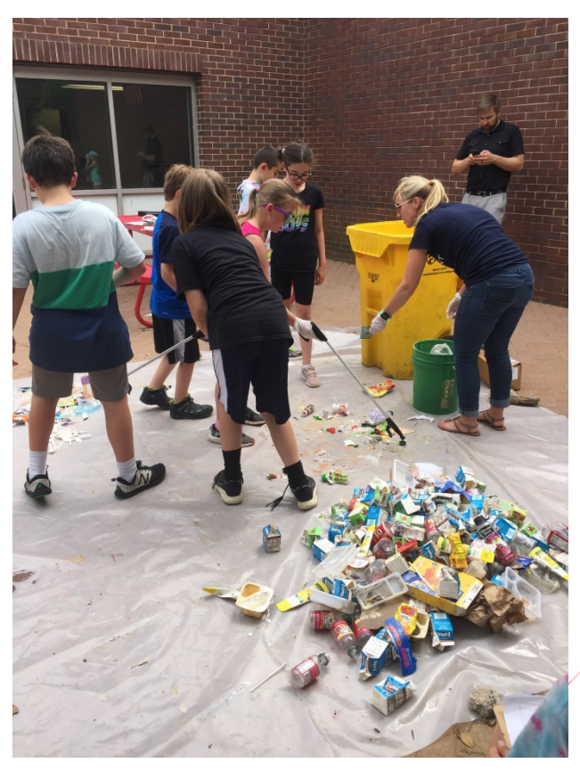
Students worked with the Parkway School District Director of Sustainability and Purchasing to conduct an audit of waste materials from a given day at Claymont Elementary School.

District programs ensure that building materials meet volatile organic compound (VOC) standards, while lead and asbestos management plans and an IAQ task force ensure that Claymont is a healthy place to learn and work. Physical and mental wellness programs for both students and staff help to ensure needs are being met with support. The green team has begun work on an indoor tower garden to bring fresh produce choices to the daily lunchroom salad bar. Claymont offers the staff a variety of wellness activities, as well as Pilates and yoga classes. Additionally, staff benefit from a book club, flu shots, and healthy luncheons.