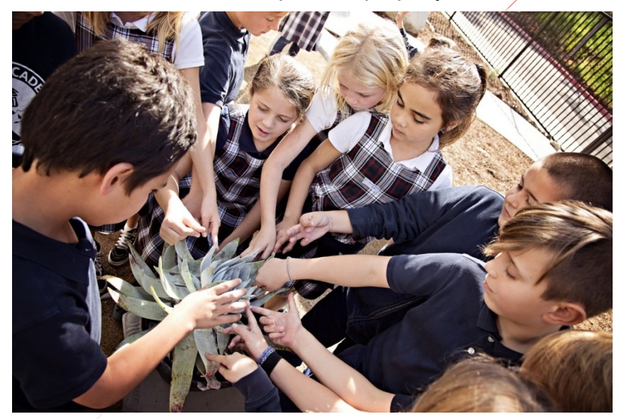
Third-grade students at St. James Academy explore succulents in the native plant garden.