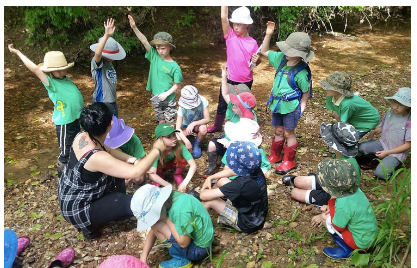
Raintree School students participate in circle time in a forest clearing.

Raintree's greatest waste-reduction efforts come from composting 53 percent of food waste for use in the gardens. All paper, plastic, and glass are recycled or reused on campus. More than 50 percent of school supplies are made from repurposed material from recycled goods warehouses. Kitchen policies have stopped the use of plastics and no disposables and ardently support reusing leftovers. One-third of the paper on campus was once-used and is supplied by area