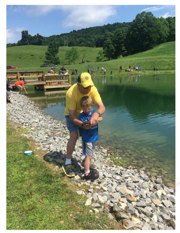
Junior Elementary School works with community partners to offer outdoor education, particularly for its fly fishing days.

The school participates in an Adopt-A-Highway project each spring. Students take a leadership role in collecting and disposing properly of trash and litter along the roadway between the river and the school.