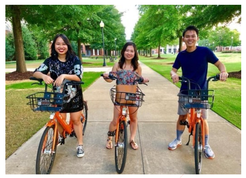
The Troy University SPIN program provides healthy, no-emission alternative transportation for students on campus and in the community.

The university provides the Trojan Shuttle Service, encouraging students, faculty, and staff to take advantage of alternative transportation both on and off campus. An expanded array of alternative transportation options goes beyond the bus system and include an app-based bike and scooter program. This service provides 100 bicycles and approximately 20 scooters.