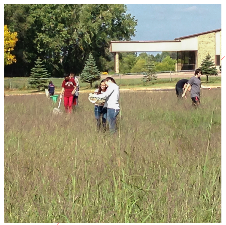
In Sioux City Community Schools, North High students engage in a safely conducted prairie burn in order to study its ecological effects.

The Sioux City Community School District participates concurrently with the ENERGY STAR Portfolio Manager and Energy CAP to track utility use.