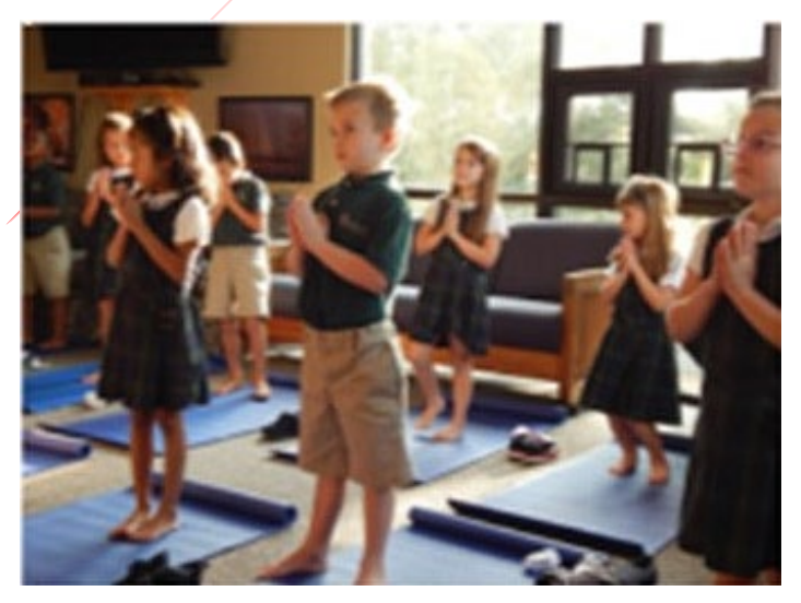
Several Immaculata Catholic School teachers, especially first and second grade, use yoga in classrooms as a way of settling children when they first arrive; during indoor recess on rainy days; or before or after large exams for older students.

In 2019, the entire middle school is focused on increasing productivity in the Immaculata courtyard garden to provide food for the hungry in the community. Along the way, they are learning how other cultures garden; new technologies and methodologies in making use of space; connecting their results with the community; and a better understanding of hunger and malnutrition. Middle-school students are tasked with examining efficient and low-cost irrigation solutions for the plants they are researching, and they are steered toward native North