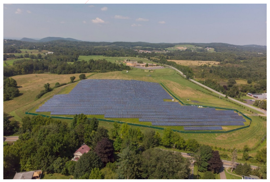
On the Warwick Valley Central School District's grounds is a 8800-panel solar field that generates enough energy for the whole district.

Warwick Valley Middle School educators. like their colleagues throughout the district, are required to incorporate sustainability and environmental concepts into curricula and class activities — and do so with creativity and enthusiasm. They often receive training and guidance from the Children's