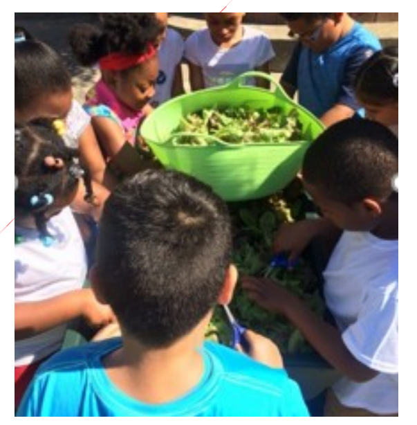
Second grade students at Captain James E. Daly Elementary School learn science and nutrition as they plant salad greens, care for them, collect data, and eat them.

Some 90 percent of Daly staff has participated in professional development in environmental and sustainable education, including Project WET, Project