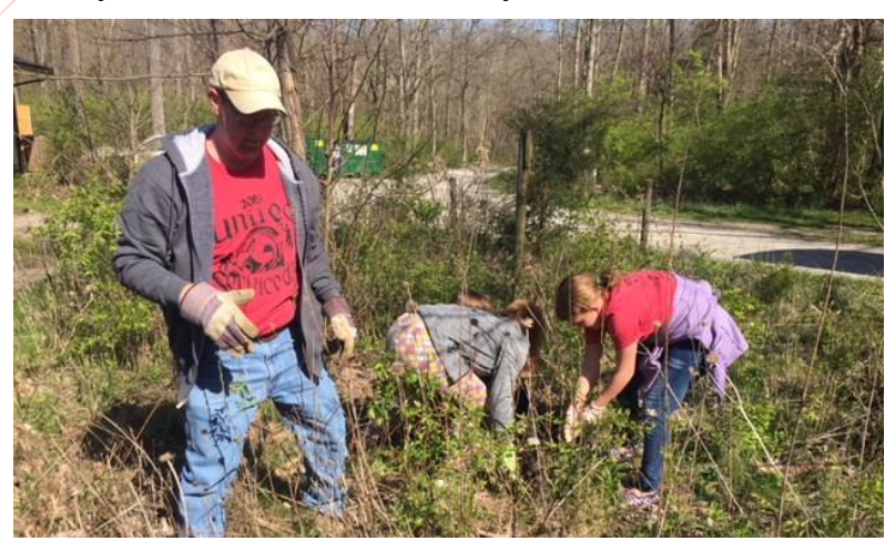
Graham elementary students and their teacher work to remove honeysuckle plants from the district's land lab and outdoor education area.

after a yearlong study with partners at Energy Optimizers and the long-term effort of Graham students, most notably the energy team at the middle school. The students worked with partners to design and develop a solar plan that will provide 75 percent of the electrical needs at both buildings through a power purchase agreement. Upon