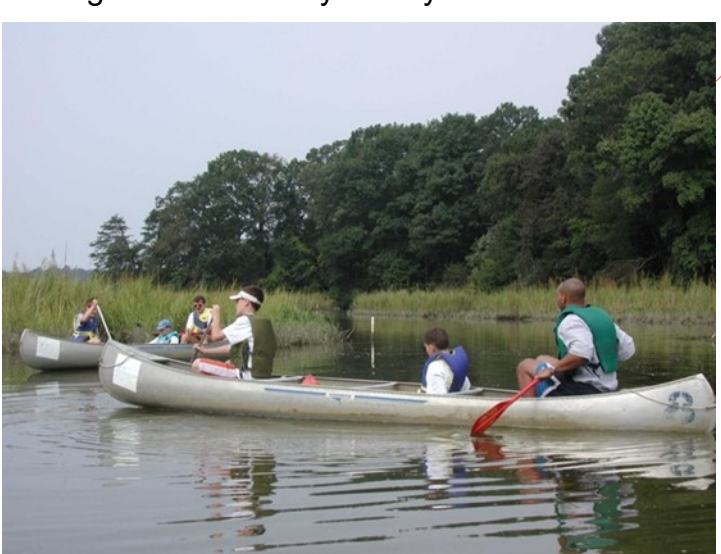
Calvert County Public Schools seventh grade students prepare to rake for submerged aquatic vegetation on Cocktown Creek.

The first Calvert County school was certified as a Maryland Green School in the spring of 2009. Now all 24 prekindergarten through grade 12 schools, as well as and one technical academy in the district, are certified Maryland Green Schools, making Calvert the only county in the state to have 100 percent of its schools