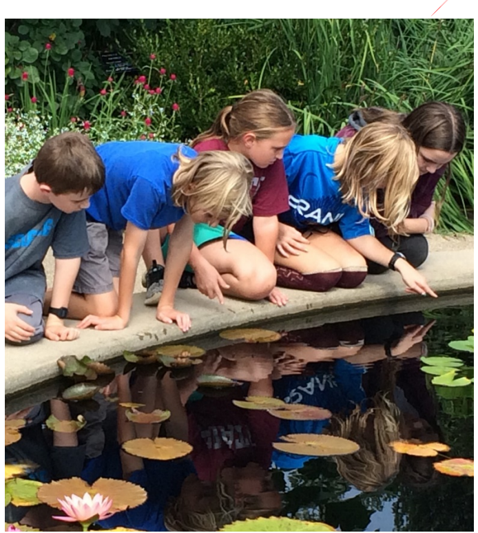
State College Friends School students engage in pond study.

Each Monday morning, classes participate in an all-school walk by doing laps around the outside of the building. This is an invigorating way for the children to begin their week of school. Children have outdoor breaks regularly, including 15–30 minutes of brain break in the morning and 30 minutes prior to lunch. Prekindergarten through first-grade classes also often take afternoon breaks. Parents are asked to provide children with weather-appropriate clothing and gear,