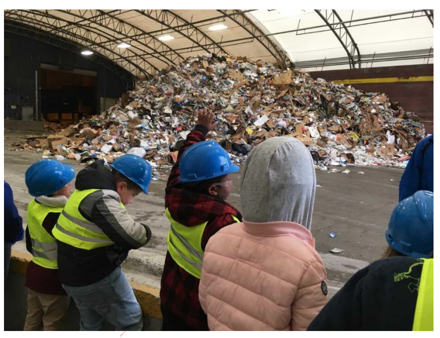
The Tates Creek Elementary Green Creek team visits the materials recovery facility in Lexington, Kentucky, to see how the school's recycling is sorted and shipped.

students are encouraged to use refillable water bottles. A container for recycling plastic bags is in the front hallway and is emptied and taken to Kroger recycling bins about every two weeks. Faculty, staff, students, and parents have added a container to collect plastic lids, which will be used to create a third upcycled plastic bench.