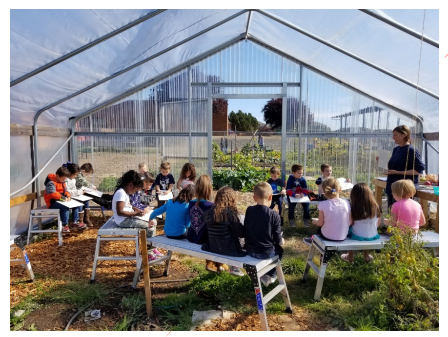
A Washington State University Master Gardener gives a lesson to kindergartners at Crescent Harbor Elementary.

What sets OHPS apart from neighboring districts is the schools' ability to work together to strengthen each other and grow. OHPS students and staff have engaged in projects that vary from schoolwide vermicomposting and recycling, to green classroom certifications in waste, water, and energy reduction, community work, designing and building tiny, high-tech homes for the homeless.