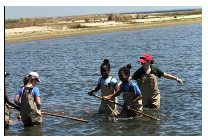
Calvert County Public Schools third grade students seine to look for potential sources of food for diamondback terrapins to determine whether Flag Pond would be an appropriate release site.

Each school has a wellness policy, and all negotiated labor agreements offer a stipend for employees through a partnership