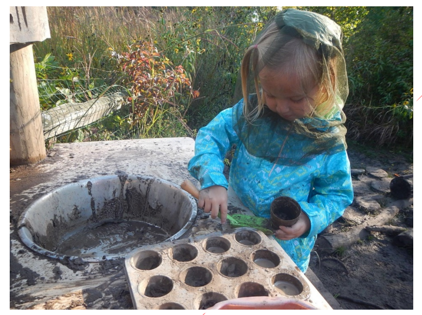
Muffin making in the mud kitchen at Schlitz Audubon Nature Preschool supports counting skills and imaginative play.

The preschool uses as many recycled, upcycled, natural, and environmentally sustainable products in the classroom as possible, from educational materials to cleaning supplies. The preschool teachers make a point of reducing, reusing, and recycling in classrooms and teaching this behavior to students. The preschool uses an educational three-bin compost system, and it aims to become a zero-waste school either by repurposing materials, such as play dough and paper, into new art projects; or by recycling; or by composting everything eaten. Schlitz has a dishwasher and sanitizer that allows the school to avoid paper plates and utensils, and the school serves food family-style.