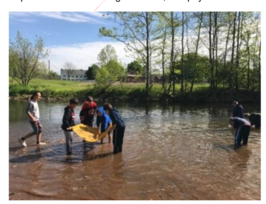
Fourth-grade students at Holland Brook school go on a river field trip and evaluate water quality based on organisms present.

Food-centric birthday and holiday celebrations have been eliminated, and children are encouraged to stay hydrated by refilling their reusable water bottles at water-bottle