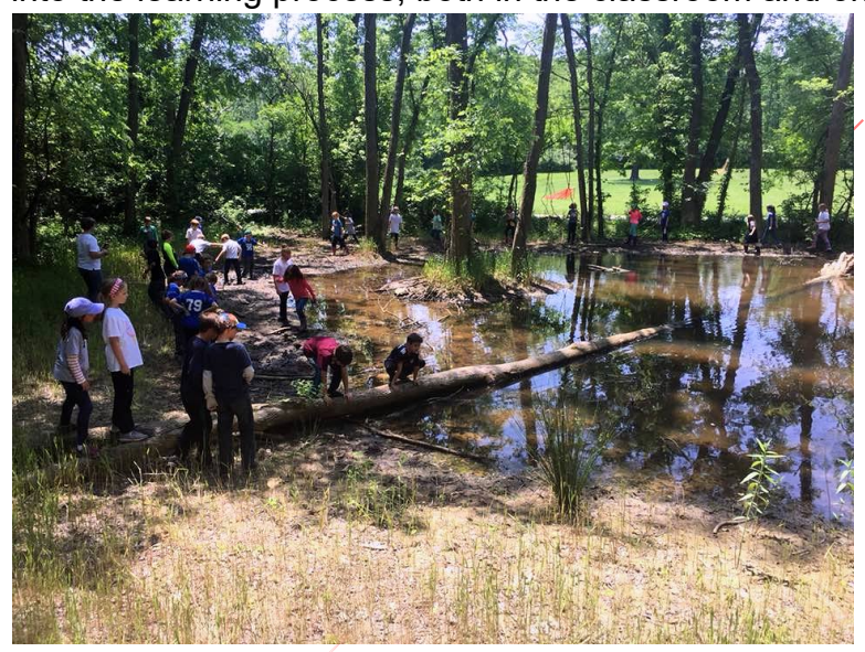
In their science curriculum, Saint Agnes students learn about how wetlands act as natural buffers, provide critical habitat for wildlife, mitigate flooding and help improve water quality. Saint Agnes students in grades 3-5 created and now maintain natural wetlands on campus.

All students take part in a structured physical fitness curriculum. More than 70 percent of students participate in an organized sport at some point during the school year, with many students doing so every season. Saint Agnes has a no-cut policy, so every student can play on a team, regardless of ability or financial need. Prekindergarten, kindergarten, and first-grade students take part in the Minds in Motion curriculum, a kinesthetic approach encouraging students to integrate motion into the learning process, both in the classroom and on the campus green space. In