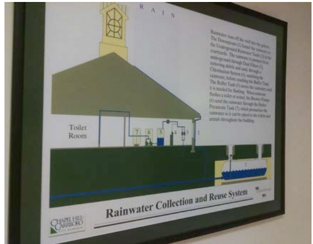
Educational sign about the grey water system at Morris Grove Elementary

Northside Elementary is taking leadership role in the district by using their LEED Platinum facility as a learning tool. A committee of teaching staff, technology staff, the district Sustainability Coordinator and one of the buildings architects has been working since the school opened to integrate the facility into every standard within the curriculum. From material use, to site selection, water flow, electricity, human's role in the world, habitats and ecosystems, each element of their curriculum can be discovered within the entirety of the building- design, community engagement, material choice, construction and operation. The committee meets monthly to further the integration and build lesson plans that are then rolled out to the teachers within the school. Northside hosted 3 rd graders from Carrboro elementary- one of the districts oldest buildings- to learn about green construction and how their building is similar and different. Those students then went back to their school, looked at it from a sustainability perspective and came up with recommendations. This was all part of the 3 rd grade entrepreneur unit where the students had to critically analyze if business positively or negatively impacts the community and the environment.