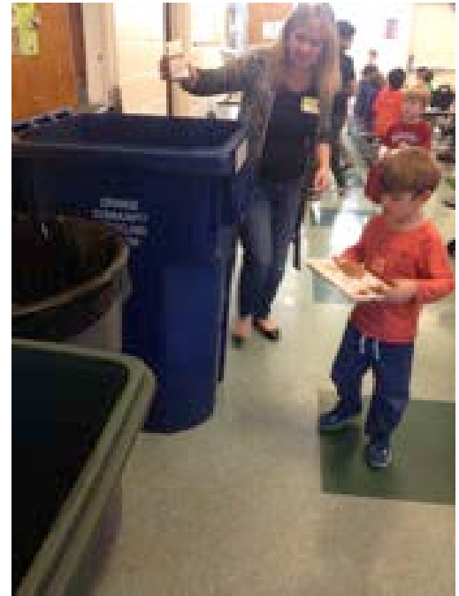
A parent volunteer assists a Kindergarten student with compost separation.

Community involvement is essential to our success as a district and we have developed close relationships with parents and community partners. During the roll out of our cafeteria-composting program, we had over 250 parent and community volunteers spend time in our schools helping students sort and learn about composting. Their efforts resulted in over 500 volunteer hours. In addition to parents and volunteers, we have a strong relationship with University of North Carolina's Center for Health Promotion and Disease Prevention. With their support, research and partnership, we utilize best practices of encouraging students to eat healthy and proactively take care of their health.