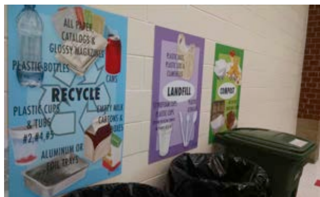
Student designed Recycle, Landfill and Compost signs in all of our elementary and middle schools.

We are taking an active stance to significantly reduce our paper use throughout the district. We have replaced over 400 stand-alone printers, which are wasteful, expensive and inefficient, with 250 high efficiency multi-function machines that are defaulted to double sided printing and copying and can scan to email. Many of the printers were in classrooms enabling a significant amount of waste. The multi-function machines have been placed in communal areas with the idea that the short travel distance to the