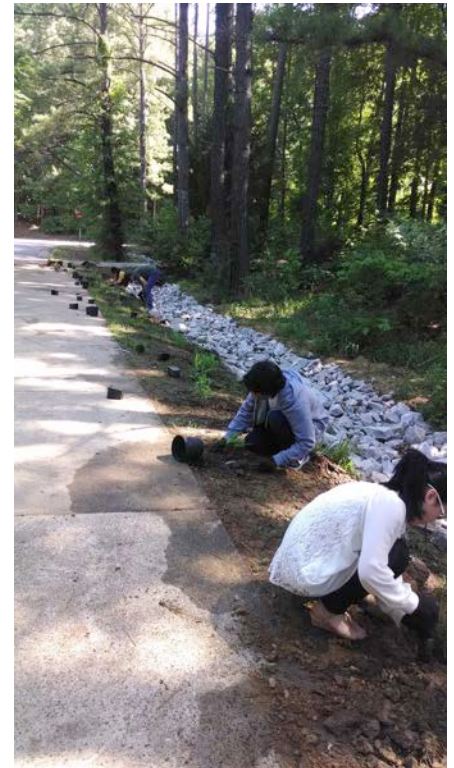
Chapel Hill High Students plant native plants as part of our partnership with NC Botanical Gardens. The native plants helped absorb and slow storm water into the newly installed rock garden- work also completed by the students.

On a district level, we are working with the Town to perform training for