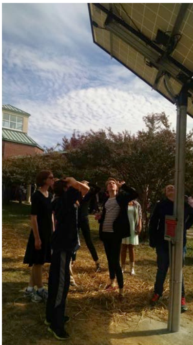
McDougle Middle School celebrates the ribbon cutting of the crowd-sourced solar learning installation. The students immediately began to learn about how it works. They now monitor its power generation, environmental benefits and are integrating it into their science curriculum.