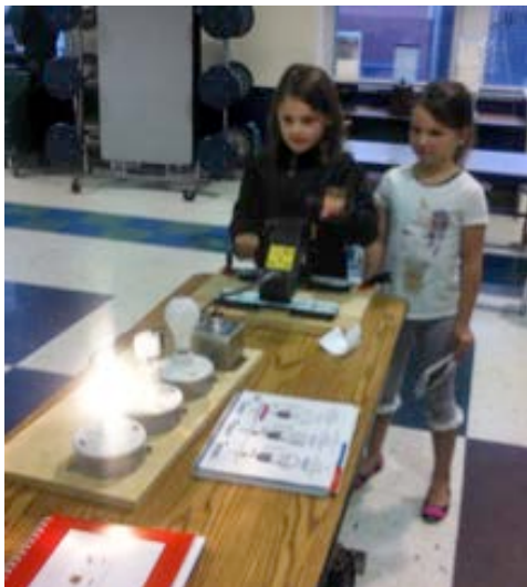
STEM night activity using a pedal-power generator to show the difference in energy use between incandescent, fluorescent and LED bulbs.

Both the Sustainability Coordinator and the Coordinator of Healthful Living and Athletics work with our food service team to implement healthy eating options and nutrition education. This is formalized through the Healthy Schools Advisory Council that is made up of representatives from each of our schools' Wellness Team. These meetings are used to share best practices, introduce new initiatives and build on the strength of ongoing programs.