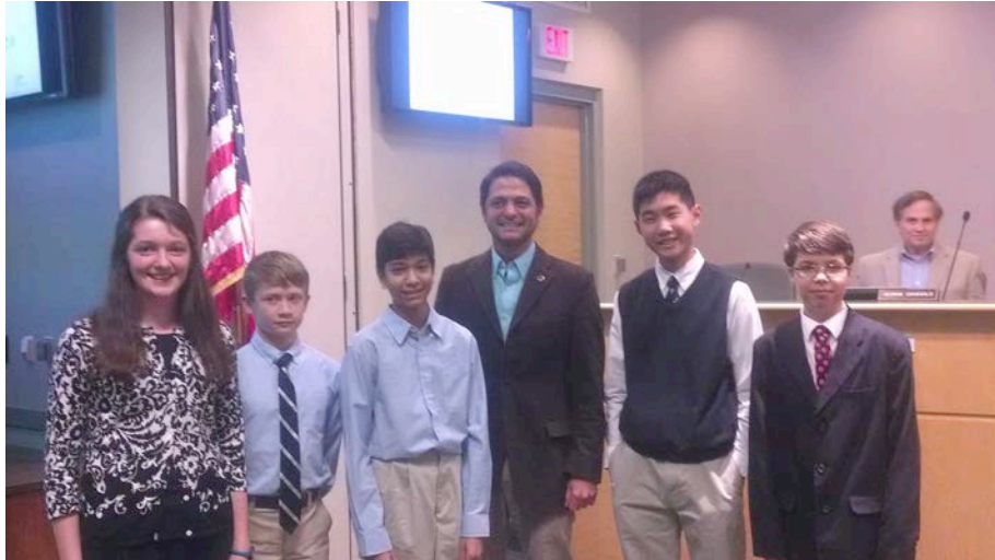
Phillips Middle Schools' Trash Terminators meet Chapel Hill Mayor and present to Town Council about their work with composting. They urged the town to look into town-wide compost collection programs.