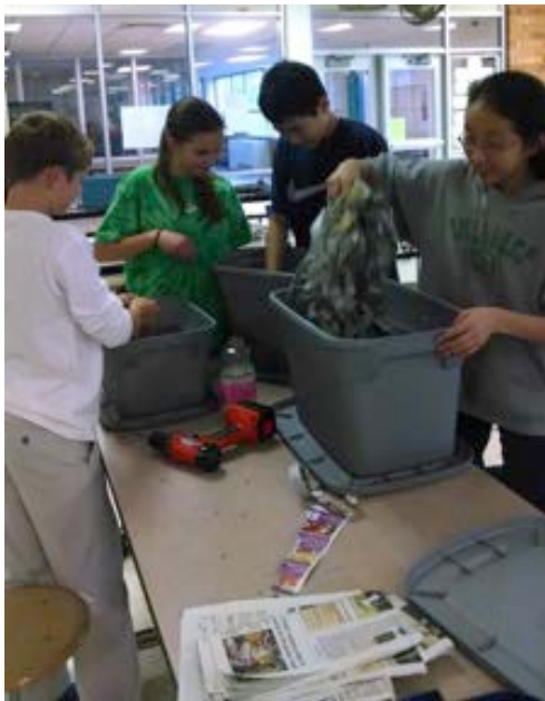
Students making worm-compost bins.

All elementary schools maintain an environmental focus as tailored to meet curricular components that span all grade levels. Topical examples include: 1st grade "Needs of Living Organisms", 3rd grade "Plant Growth and Development", and 5th grade "Ecosystems/Living Systems." All middle school students are exposed to meaningful, real-world connections to instructional standards that focus on: Human impact on atmosphere/climate (grade 7) and hydrology (grade 8). High School Environmental Science and Health