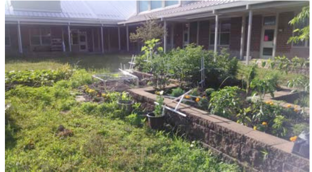
Morris Grove Elementary School's student garden

Student and Staff health is a central focus of our district. The district's Coordinator of Healthful Living and Athletics oversees our PE staff and works closely with our food service provider and nurses to provide a holistic vision and implementation of student and staff health. School gardens, walk and bike to school programs, family-marathons (26.2 miles between all family members), staff work out rooms and nutrition education are hallmarks of the district's commitment to student and staff wellness. In addition to these direct-health programs, the district has transitioned all of our cleaning supplies to green-certified, and is diligent about maintaining facilities so that they provide healthy places for students and staff to learn.