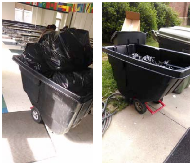
Cafeteria Landfill Waste before (14 bags) and after (2 bags) compost program implementation.

1C. Waste Reduction has proved to be a great opportunity for the district. In 2012, the district made the decision to replace Styrofoam cafeteria trays with compostable ones. This has had a major impact on our environmental impact and waste reduction efforts. We have shrunk our landfill hauling expenditure by 33% and diverted over 210 tons from the landfill through efficiency and sorting practices. This will increase this year as we implemented cafeteria composting in our elementary and middle schools. Each day, over 8,000 students sort their lunch waste into compost, recycling and landfill waste. This sorting process has enabled us to reduce our cafeteria waste within those schools by 88% (155 bags a day down to 18). Our next phase is to analyze what is going in to each waste stream and see where we can be more efficient in our purchasing and use of materials. As we increase efficiency in this program, we will save additional dollars by reducing the numbers of dumpsters in the district. This program is rolled out hand-in-hand with curricular materials on compost and waste. The success of this program has led to invitations from other districts to consult on starting composting programs as well as presentations at both Chapel Hill Town Hall and Carrboro City Council.