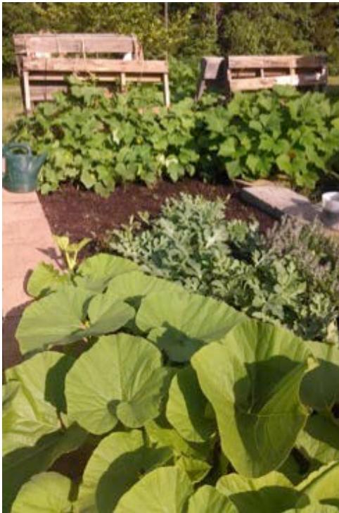
Rashkis Elementary School's Student Garden, utilizing repurposed pallets.

Our food service provider was awarded a Farm To School grant last year that enabled us to increase our