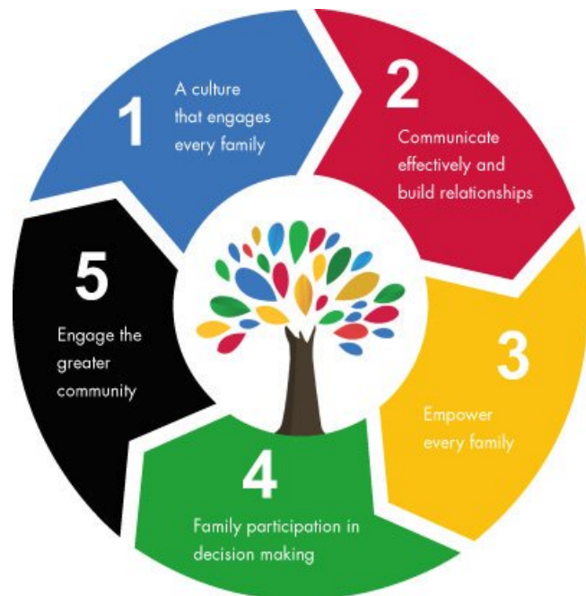
Figure 6: Family Engagement Logic Model

(Constantino, 2016). As a direct result of this internal committee's recommendations and