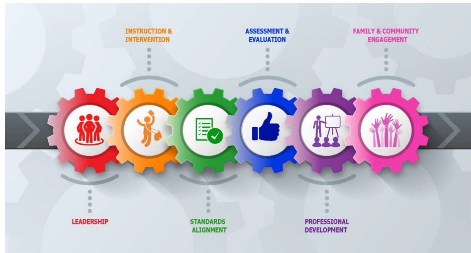
Figure 2: Six Essential Elements of the ND CLIP

Then, in March of 2019, the State Literacy Team convened to engage in the continuous review process. Currently, the NDDPI has a draft open for public feedback (Appendix H). It is anticipated the current draft, renamed the ND CLIP, will be finalized in June 2019. The combined expert recommendations, as described in the ND CLIP, are comprised of six essential elements: leadership, instruction and intervention, standards alignment, assessment and evaluation, professional development, and family and community engagement (Figure 2). These