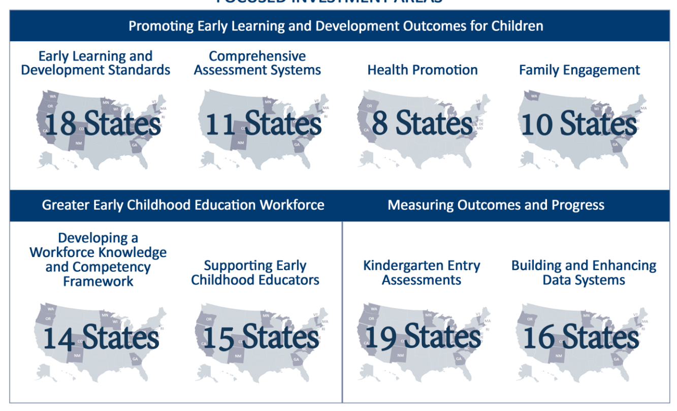
Figure 2. RTT-ELC Grantee States selected to work in these focused investment areas.