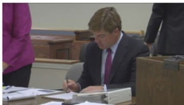
Kentucky Attorney General Jack Conway

LOUISVILLE, KY (WAVE) - Big money and wasted dreams. ITT Technical Institute is being sued by Louisville students who claim they were misled to get them enrolled. ITT is one of the largest for profit education companies in the US. And now, some serious allegations are being leveled against the people who run their Louisville campus. It's the latest black eye for the for-profit college industry in Kentucky.