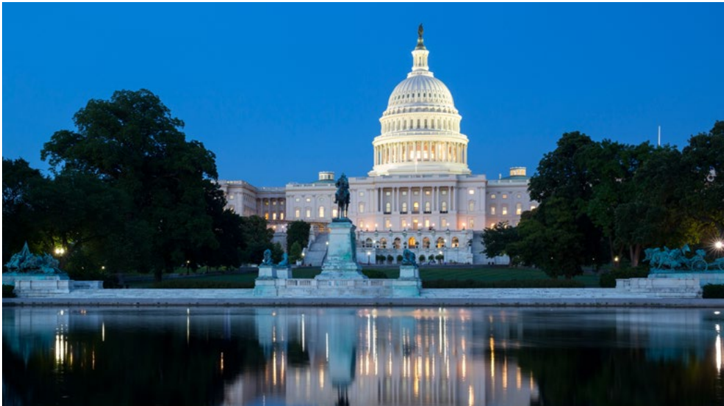
West Front of the U.S. Capitol Building, Washington, D.C.

The role of an IG is to prevent and detect waste, fraud, and abuse relating to each agency's programs and operations, and to promote economy, efficiency, and effectiveness in the agency's operations and programs.