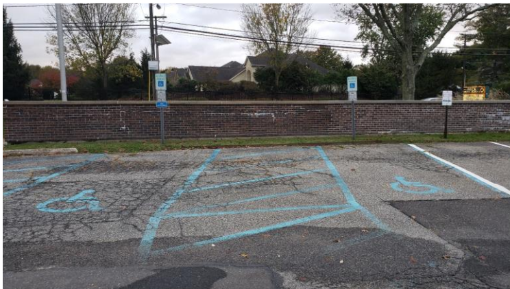
South Lot – Spaces 2 and 3 and shared access aisle

The two other designated accessible spaces in the South Lot (Spaces 2 and 3) are located next to each other and across from Entrance 1. Both spaces are marked with the International Symbol of Accessibility. Space 2 is 105” wide with a running slope of 4.0% and cross slope of 1.5%. Space 3 is 105” wide with a running slope of 2.3% and a cross slope of 1.1%. Spaces 2 and 3 share a marked access aisle that is 111” wide with a running slope of 3.2% and a cross slope of 1.1%. OCR determined that the access aisle leads to a crosswalk that connects to the designated route to Entrances 1 and 2. The crosswalk leads to a curb ramp to the sidewalk in front of Entrance 1.