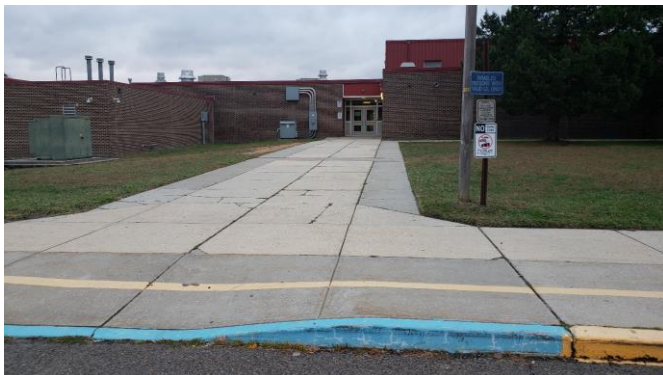
West Lot – Second curb ramp on the designated route. The entrance visible is not a designated accessible entrance.