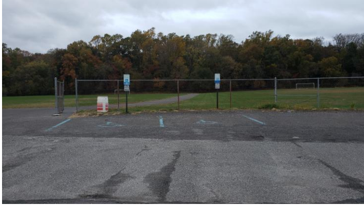
West Lot – Spaces 4 and 5, located in north end of parking lot

162” wide with a running slope of 3.2% and a cross slope of 0.4%. Space 5 is 162” wide with a running slope of 3.1% and a cross slope of 0.6%. Both spaces are marked with the International Symbol of Accessibility. There is no designated access aisle next to either Space 4 or 5, although there is open space on either side of Spaces 4 and 5.