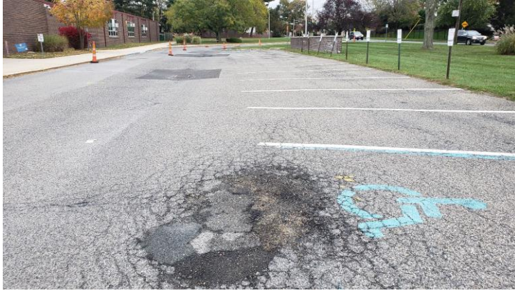
South Lot – Space 1, looking east at the designated route to the designated accessible entrance and towards Spaces 2 and 3. There are 10 parking spaces between Space 1 and Space 2.

The two other designated accessible spaces in the South Lot (Spaces 2 and 3) are located next to each other and across from Entrance 1. Both spaces are marked with the International Symbol of Accessibility. Space 2 is 105” wide with a running slope of 4.0% and cross slope of 1.5%. Space 3 is 105” wide with a running slope of 2.3% and a cross slope of 1.1%. Spaces 2 and 3 share a marked access aisle that is 111” wide with a running slope of 3.2% and a cross slope of 1.1%. OCR determined that the access aisle leads to a crosswalk that connects to the designated route to Entrances 1 and 2. The crosswalk leads to a curb ramp to the sidewalk in front of Entrance 1.