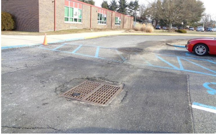
South Lot – Spaces 2 and 3 and shared access aisle leading to a curb ramp