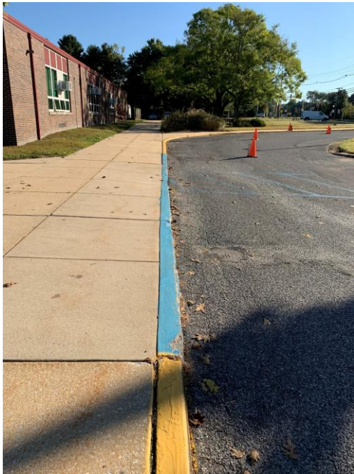
South Lot – Access aisle leading to the curb ramp and Entrance 1

During its investigation, OCR identified accessibility issues regarding the location, ground surface, access aisle, running slopes, and route for Space 1; the curb ramps for the accessible route to Entrance 2; the running slopes of Spaces 2 and 3; and the running slope of the shared access aisle in the South Lot (See Appendix).