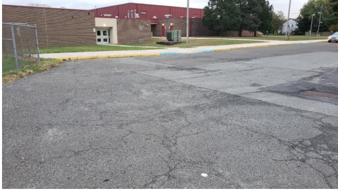
West Lot – View of same entrance from closer vantage point; first curb ramp to sidewalk visible.

[photo deleted as it contains personal information]