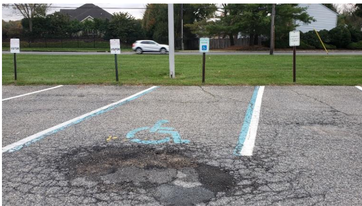
South Lot - Space 1

The first designated accessible space (Space 1) is located 10 parking spaces to the left of the two other accessible spaces in the South Lot (Spaces 2 and 3). Space 1 is 120” wide with a running slope of 3.1% and cross slope of 0.6%. Space 1 is marked with the International Symbol of Accessibility. Space 1 lacks an access aisle, and its ground surface is marred by cracks and potholes.