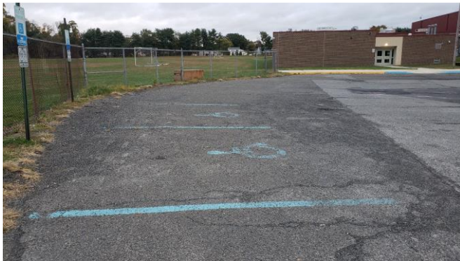
West Lot – View of Spaces 4 and 5, looking towards the designated route. The entrance visible in the picture is not a designated accessible entrance.

There are three entrances to the School on the west side of the building, but only one designated accessible entrance (Entrance 3). Entrance 3 is the entrance located farthest from the designated accessible spaces in the West Lot. The designated route from Spaces 4 and 5 to Entrance 3 has three curb ramps, corresponding to each entrance on the side of the building. One curb ramp is directly in front of the path to the Entrance 3 while the two other curb ramps do not lead to designated accessible entrances.