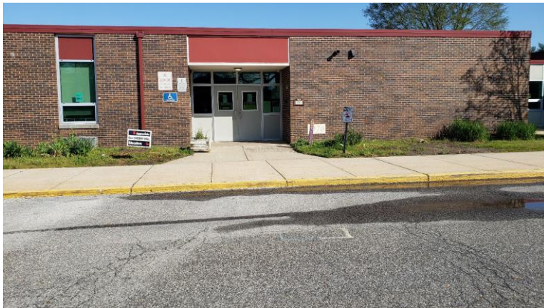
South Lot – Entrance 2 lacks curb cut - Entrance 2 is to the left of Entrance 1 when facing the School building

Accessible parking spaces must be located closest to the nearest accessible entrance on an accessible route. See ADAAG/UFAS 4.6.2. 1 Space 1 is located closer to Entrance 2 than to Entrance 1, but it is not the parking space closest to Entrance 2. Additionally, despite there being a crosswalk to Entrance 2 from the parking lot, there is no curb ramp from the parking lot to the sidewalk in front of Entrance 2. A curb ramp is required wherever an accessible route crosses a curb. See ADAAG/UFAS 4.7.1. To gain access to Entrance 2, an individual would need to traverse the designated route to Entrance 1 (traveling through the parking lot itself), 2 then backtrack on the sidewalk to reach Entrance 2. OCR determined that there are many parking spaces located closer to both Entrance 1 and Entrance 2 than Space 1. Therefore, OCR determined that Space 1 is not located on the shortest accessible route to an accessible entrance.