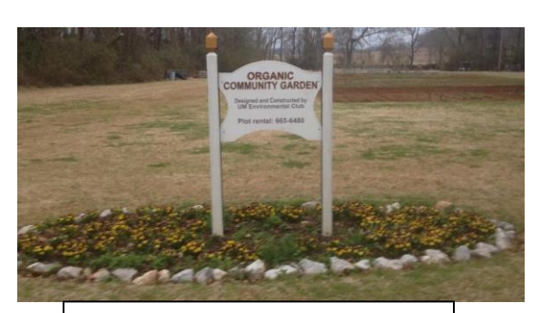
The UM Organic Community