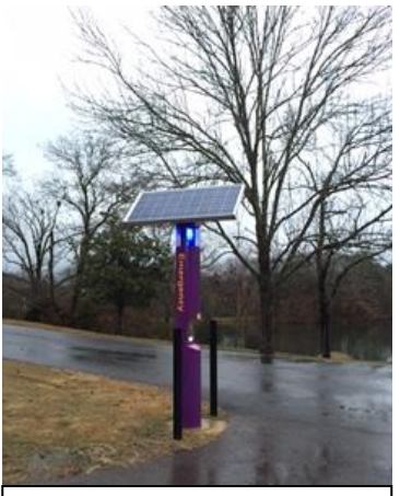
Solar Powered Code Blue for Safety at UM Lake

and at the campus Kiln. A solar demonstration project is also underway, as a Green Fund grant recently funded a solar charging station to be installed in a social space outside the Student Union.