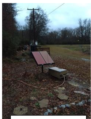
Use of Solar Power at Organic Garden