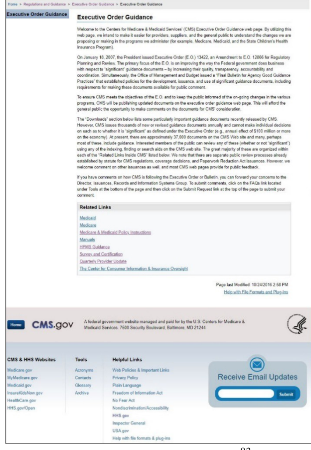
Figure 4: CMS Website<sup>83</sup>

The "Advisory Committees" link directs to a page about advisory committees,<sup>80</sup> the "Privacy Office" link directs to a page about the privacy office,<sup>81</sup> and the "CMS Small Business Administration Ombudsman" link directs to the Ombudsman's webpage.<sup>82</sup> None of those appear to provide any information other than general information about their intended subjects, and no guidance documents.