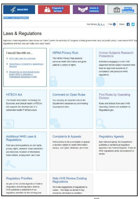
Figure 5: HHS Website<sup>90</sup>

In light of the Department's outsized portion of the federal budget and the serious deficiencies with respect to the Department's response, Committee staff requested additional information, which was met with resistance. During the course of the Committee's engagement with the Department, it became clear the Department suffered from the lack of any internal tracking mechanism for existing guidance documents or any central planning process for the development and promulgation of guidance documents.<sup>89</sup>