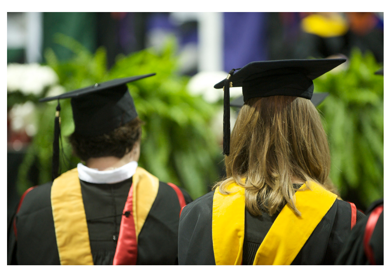
A GUIDE FOR SUCCESS IN SECONDARY AND POSTSECONDARY SETTINGS U.S. Department of Education October 20, 2015