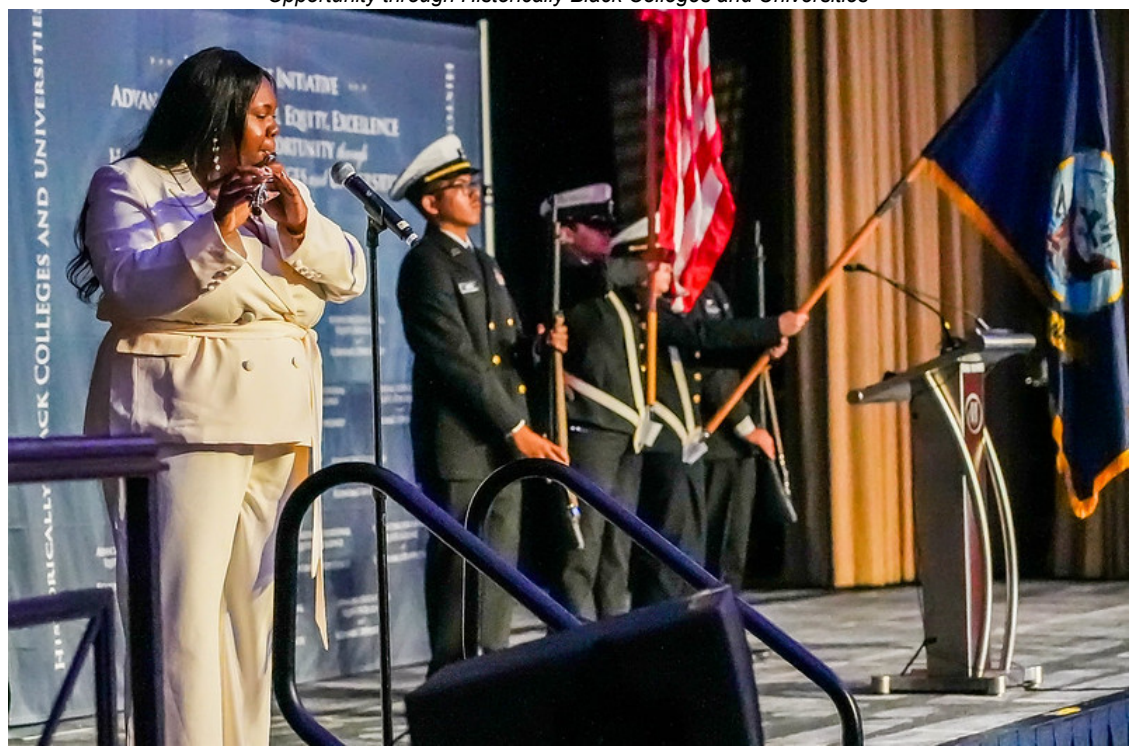
Student flute performer and military color guard.