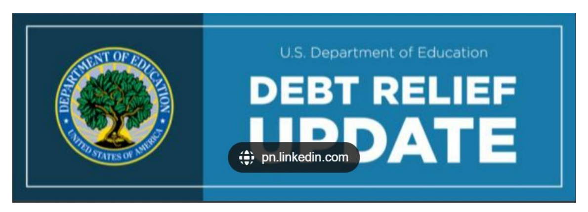
Please review the latest news on student debt relief.

Source: The U.S. Department of Education Press Release